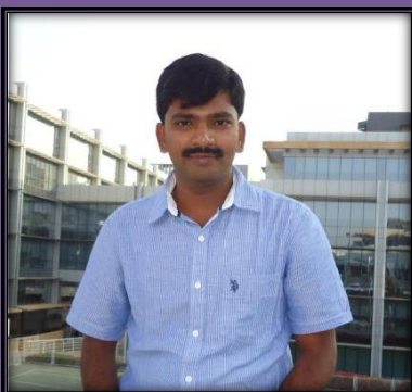
M.Tech IIT Guwahati. Software Engineer at Brocade , CISCO. 2005 Graduate